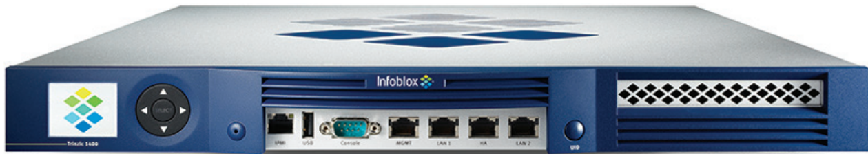
PT - 1400

The Advanced Appliances have next-generation programmable processors that provide dedicated compute for threat mitigation. They offer both AC and DC power supply options, and 1-GigE and 10-GigE options.