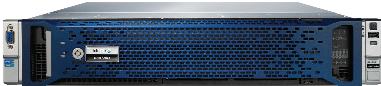
PT - 4000