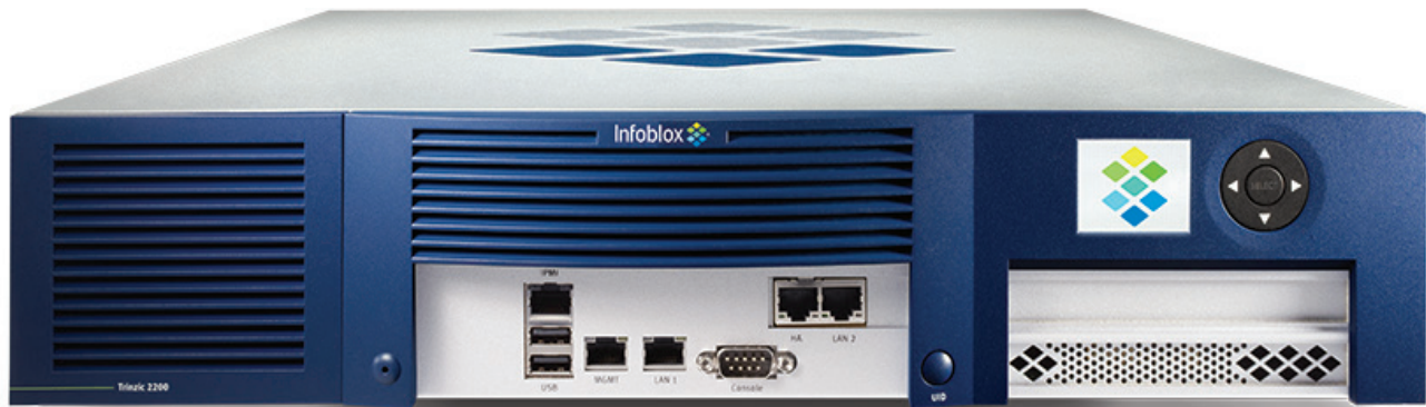
PT - 2200